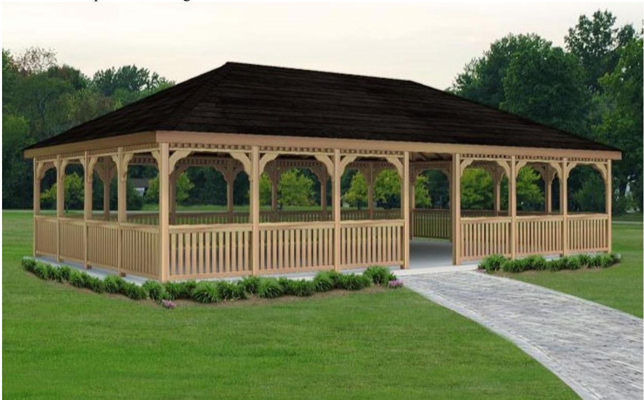
Rendering of Gazebo demonstrating required architectural elements

Please note the concrete slab shown in the above aerial view has been removed, graded and grassed. A new concrete slab is part of this scope of work. Gazebo site shall be fine graded prior to concrete slab installation for positive drainage.